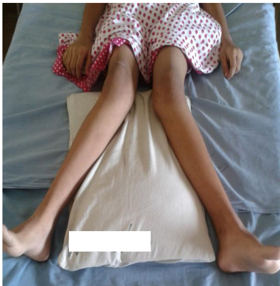
Fig. 1 Bilateral genu valgus deformity

symptomatic and have end organ damage at the time of presentation [2, 4]. This is in contrast to adults where most of the cases of PHPT are diagnosed by incidental detection of hypercalcemia during routine investigations in asymptomatic patients. Children can present with various non specific symptoms involving gastrointestinal, musculoskeletal, renal and neurological systems due to hypercalcemia. Our patient presented with genu valgum. Skeletal survey revealed bilateral SUFE with bilateral genu valgum, displacement of epiphysis of bilateral humeri, rugger jersey spine and sub periosteal bone resorption involving radial aspects of phalanges in hand. Genu valgum is a rare presentation in children with PHPT with only 10 cases reported in literature. These 10 cases are summarized in an article on Genu valgum and primary hyperparathyroidism in children by Ramkumar et al. [5]. Most of these patients had genu valgum at presentation indicating an etiological link. All these patients had solitary parathyroid adenoma and none were reported vitamin D deficient. Genu valgum can also manifest in vitamin D deficiency which can also cause a similar clinical picture due to tertiary hyperparathyroidism. Our patient had biochemical evidence