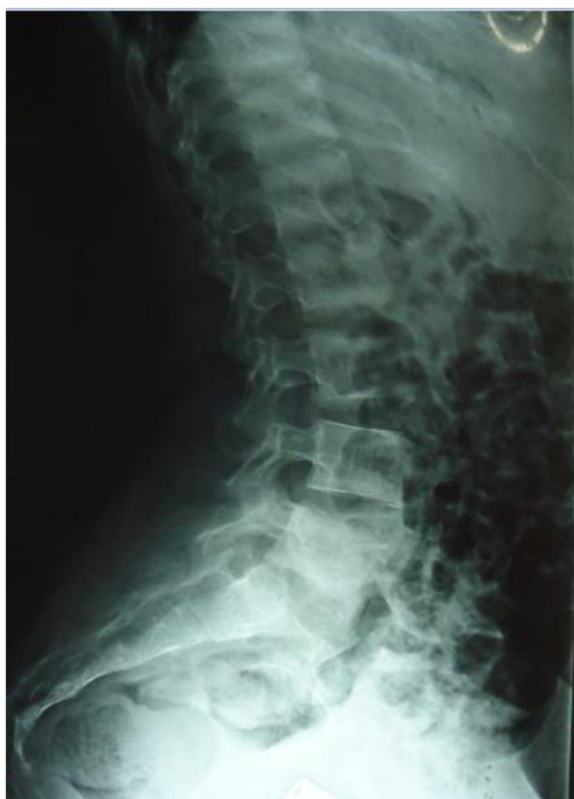
Fig. 4 X ray spine showing rugger jersey spine