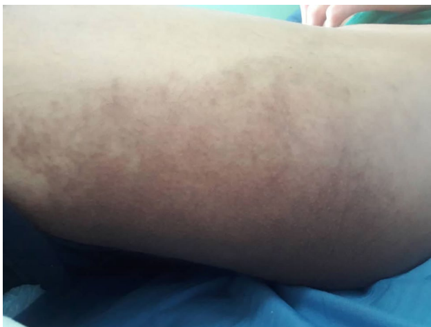
Fig. 6 Hyperpigmented plaque with clear borders

portions of the thighs. Recent reports of premature canities have been made [5], and one case had only cutaneous symptoms that appeared in adults [6]. The histopathology shows thicker collagen bundles and extensive fibrosis [5]. Despite the fact that it is obvious that endocrine symptoms make up a significant portion of H syndrome,