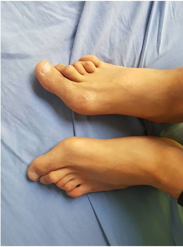
Fig. 3 Hallux valgus